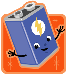
Change your Batteries.